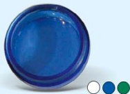
Infrared PC cover