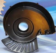
Custom plastic part