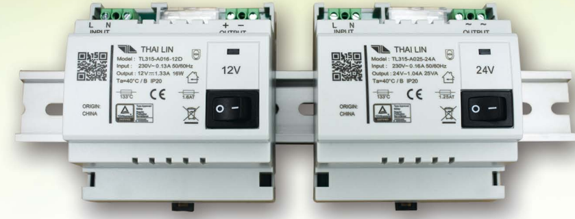
DIN RAIL POWER SUPPLIES • Output ranges: 12/24V AC, 20-100VA and 12/24V DC, 16-60W • Ta = 40°C • IP20-rated • Short-circuit-proof • Thermal cutoff protector • IEC 61558-certified