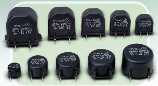
Encapsulated common mode line filters