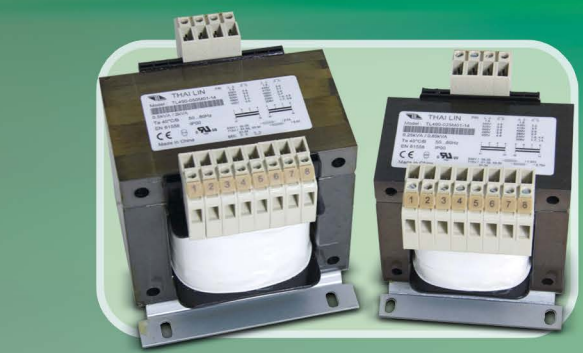
Motor Starter Control Transformers • UL 5085-1-2/cUL C22.2-certified, complies with EN61558-2-2 • Power range 0.25KVA to 2.5KVA • Operating frequency 50/60Hz • High short-duration power rating • Ambient temp (Ta) -40C to 50C • Built with UL Class F/155C insulation • Dielectric strength 4,000Vrms • Handles peak current more efficiently • Ideal for handling current surges in heavy duty electrical applications