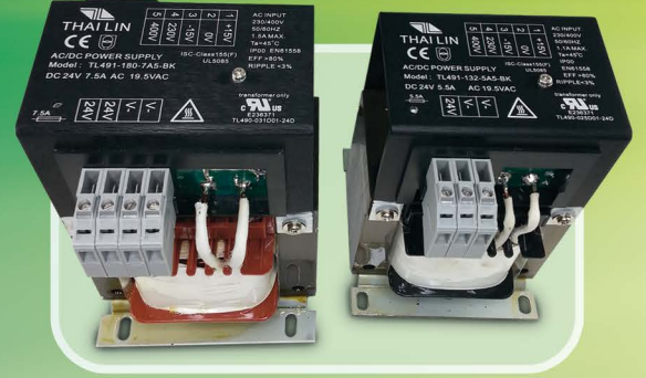
Single-phase Non-stabilized DC power supplies • UL certified transformer with UL5085-1/2 construction • AC input 115V/230V or 230V/400V, 50/60Hz • Isolated DC output 24V at 5.5A to 10A with LED indication • Residual ripple factor 3% or less • Efficiency 80% min/Ta 45C • Not susceptible to voltage surges or transients • High overload capacity • Corrosion-resistant/high heat-transfer aluminum bracket • Ideal for HVAC engineering/power-related industries