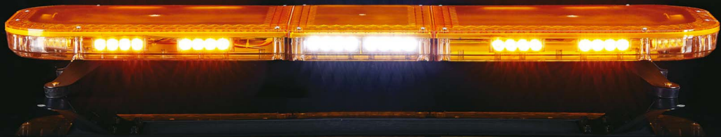
LED light bars