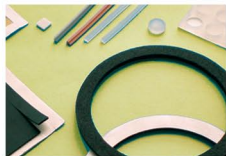
Silicone cushions, strips, rubber foot and rings