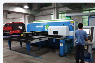
CNC machine from Finland