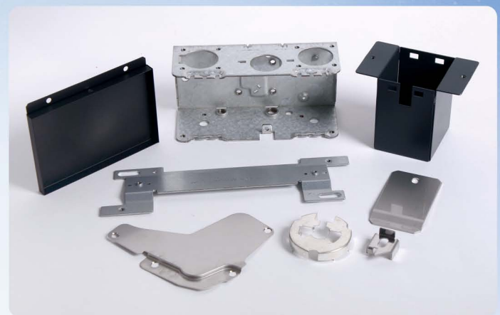
Sheet metal parts

Contact our sales representatives today.