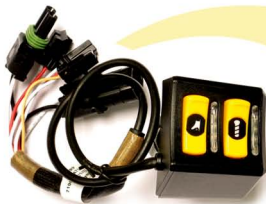
Advanced digital thermal control