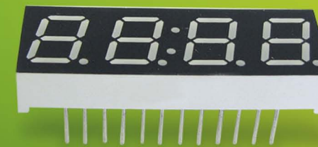
LED numeric display