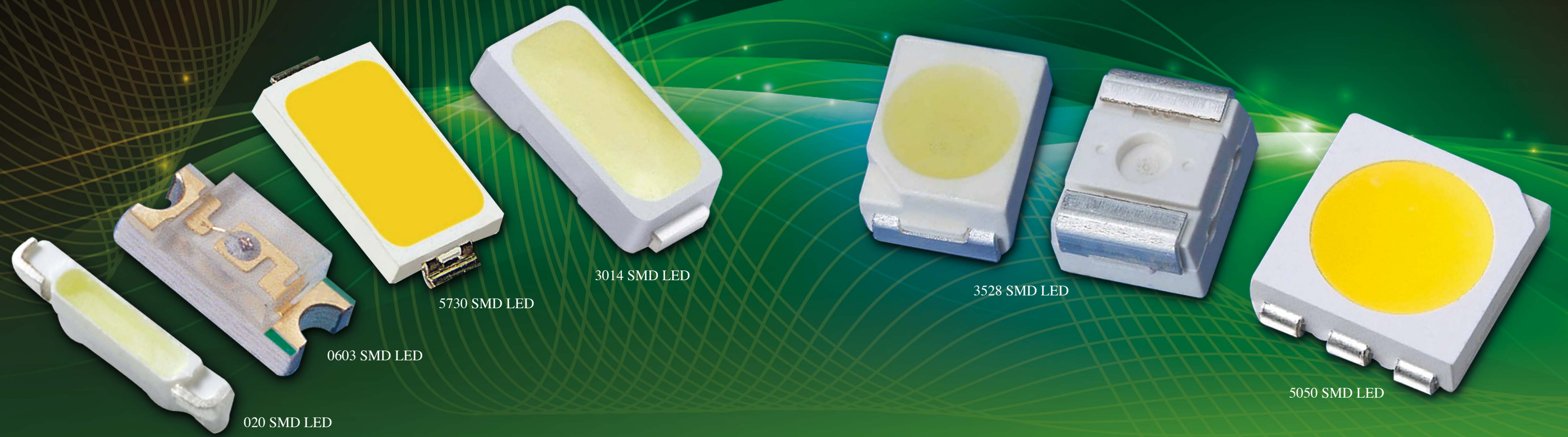
020 SMD LED