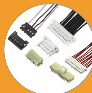
Wire to board connectors