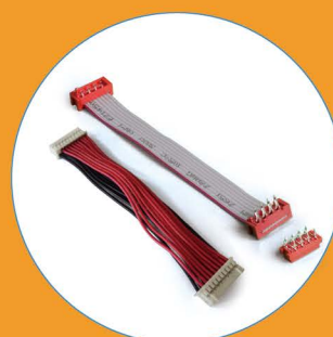
Cables and wire harnesses