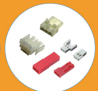
Wire to wire connectors