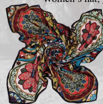
Women's viscose scarf