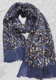
Women's boiled wool scarf