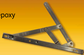
Stainless steel friction stay, available in various materials (HW1141)