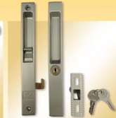
Zinc alloy patio door handles (WT2526)