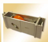
Aluminum sliding roller (WT4862)