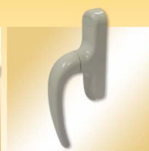
Aluminum window handle (WT4538)