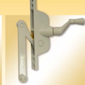
Zinc alloy window operator (WT2441)