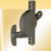
Zinc alloy window operator (WT2509)