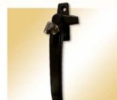
Zinc alloy casement window handle (WT1733)