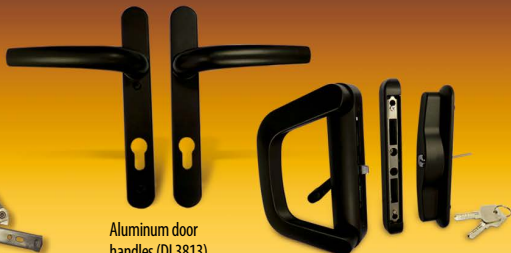
Aluminum door handles (DL3813)