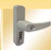
Aluminum window combination latch (WT4373)