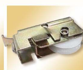
Stainless steel sliding door roller (WT2374)