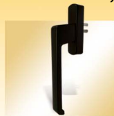
Aluminum window handle (WT4535)