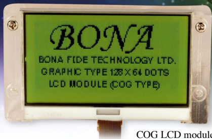
COG LCD module