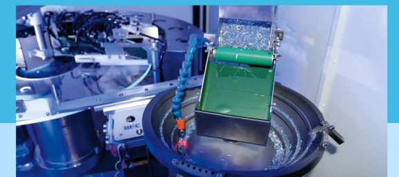
Auto size selecting machine