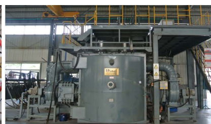
Strip casting furnace