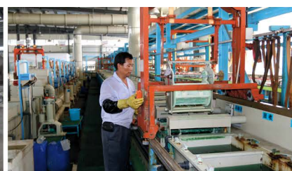
Automated plating line