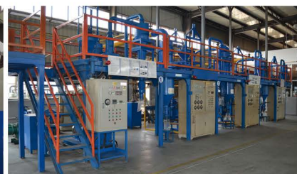
Gas flow mill