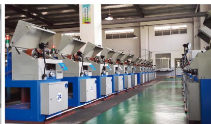
Automatic internal circle slice