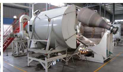
Hydrogen crushing furnace