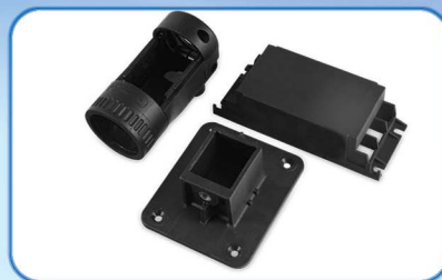
Plastic injection molds