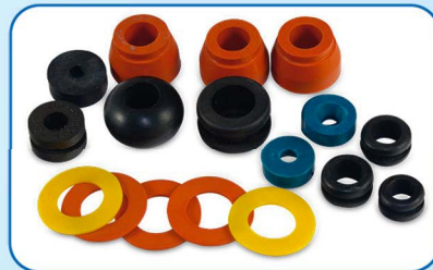
Viton rubber parts for vehicles