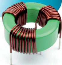
Choke coils and power transformers