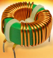
Common-mode choke inductor