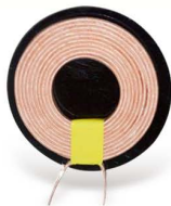
Wireless charging coil