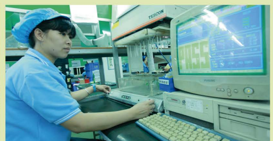
In-circuit testing • 6 automatic lines • Large-sized product assembly