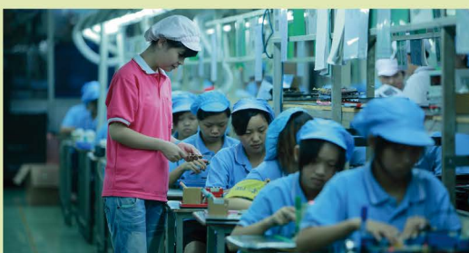
4 PCB assembly DIP lines