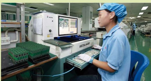
SMT and AOI testing line • 27 SMT machines • 6 SMT lines