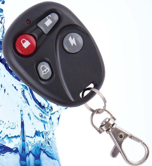
OBD II GPS tracker (GPS306)