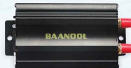
Car GPS tracker (GPS104)