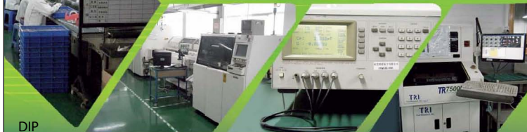
DIP equipment SMT equipment Quality-assurance equipment AOI machine