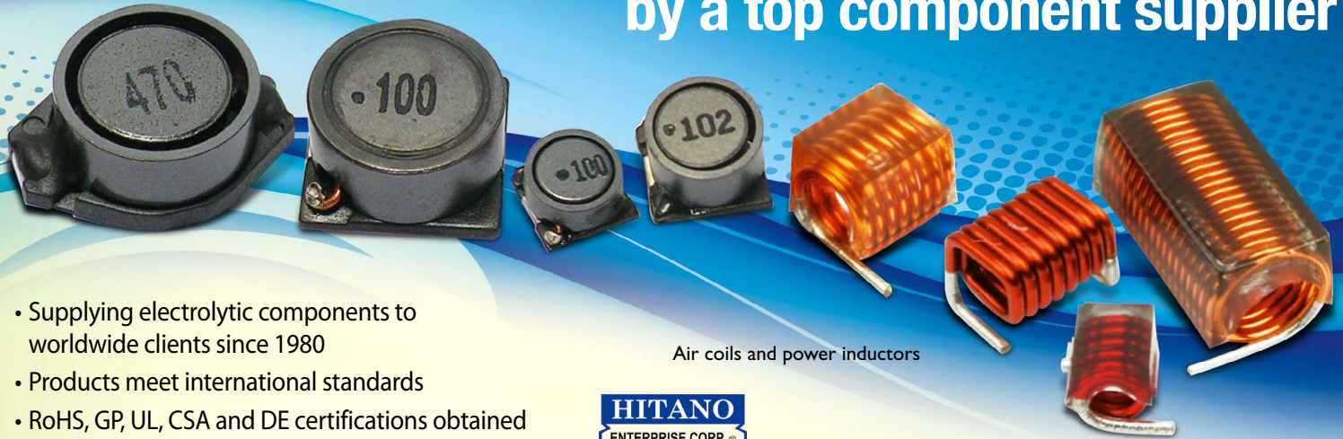
Air coils and power inductors