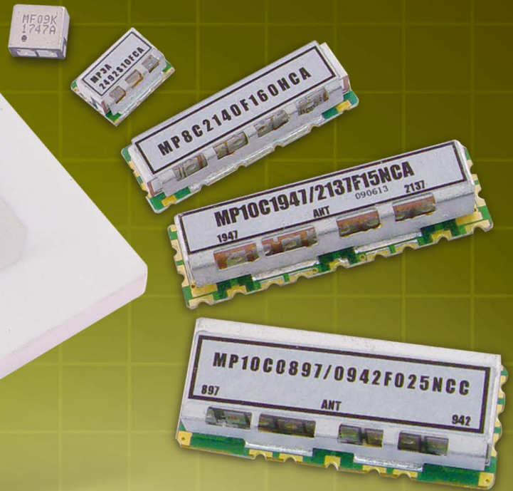
Dielectric ceramic filters and duplexers