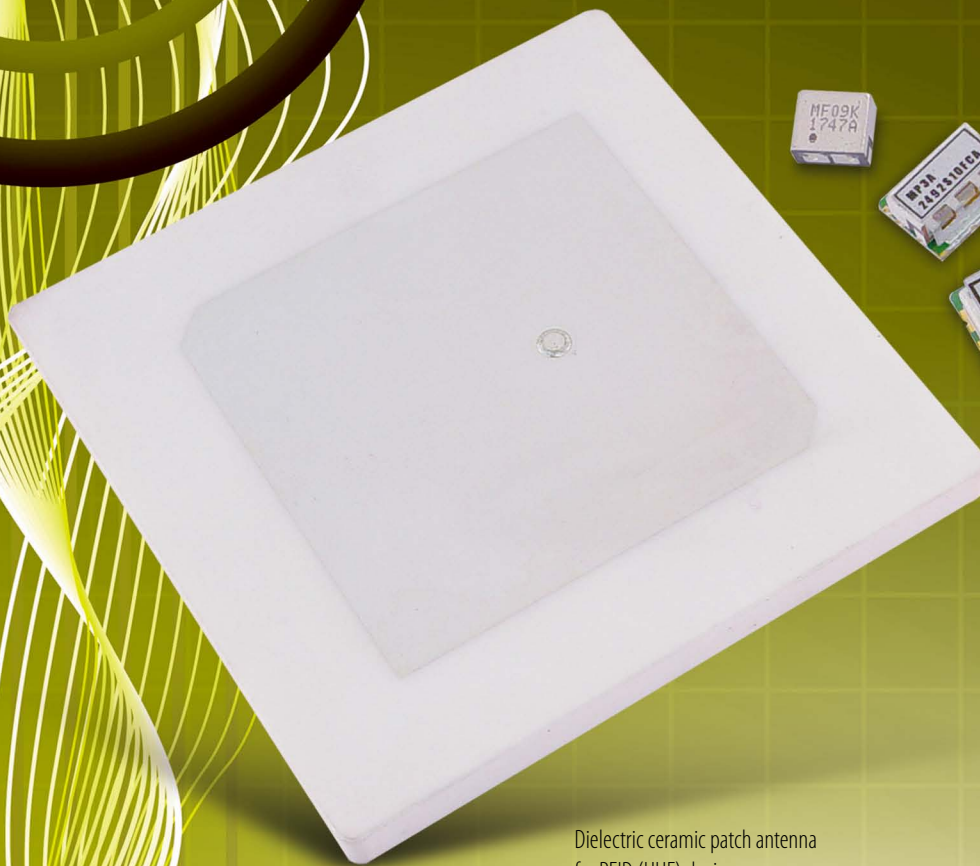
Dielectric ceramic patch antenna for RFID (UHF) devices