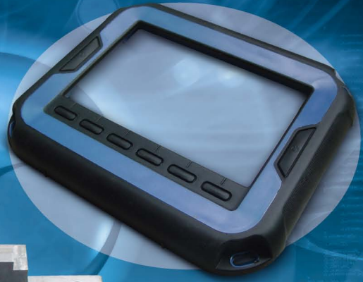
LSR over-molded to plastic/metal part