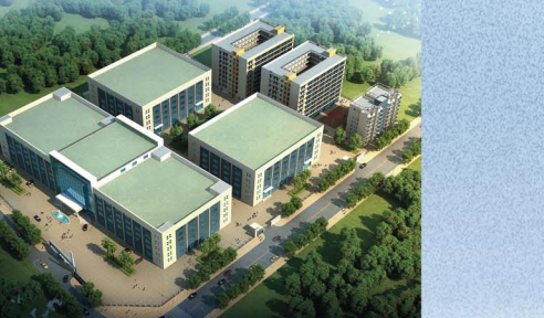
Our industrial park