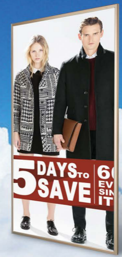
32/42/55/65" widescreen LED-backlit signage panel • 1080p Full HD resolution • Supports remote control via smartphone • Layered animation effects • Large digital storage space • Ultra high brightness • Supports USB multimedia devices • Can connect to the Internet