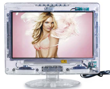
Prison TV • Meets PAL/SECAM/NTSC, ATSC, DVB-T, DVB-C, ISDB-T and DMB broadcasting standards • HDMI, A/V, YPbPr, SCART and B-CAS inputs • Supports 2-way independent sound control

For more details about our products and services, contact us today.