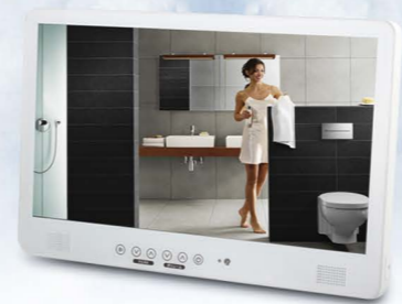
18.5" waterproof LED TV • IP68-rated • Gold/silver/acrylic mirror surface finish • Waterproof remote control