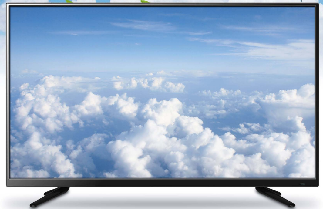
50" 3-D LED smart TV • Supports multiple languages • Android 4.0 OS • Supports video chatting • Optional HDD

Kontech is one of the leading LCD TV and monitor manufacturers in mainland China, with an annual capacity of more than 1 million units. All our production processes are ISO 9001:2008-certified.