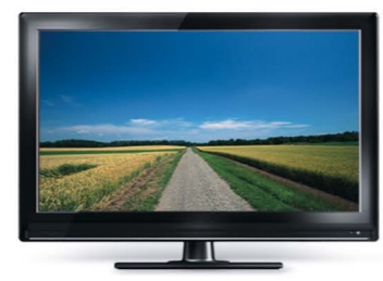
12V AC/DCTV • 8-21V or 8-36V surge protection • Built-in heat-resistant DVD player • Two AC/DC plugs with car cigarette lighter power cord • Suitable for trucks, cars, yachts and mobile homes