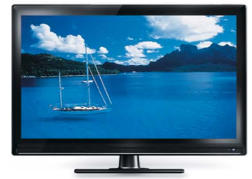
Marine TV with salt corrosion protection • Gold-coated connectors • 8-36V surge protection • Heat-resistant DVD player • 5m power cord designed especially for marine conditions