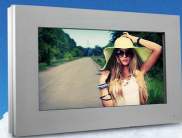
Outdoor high-brightness display • All-weather protection • IP65-rated • Ultra-high brightness: 3,000 cd/m 2 • Multimedia support