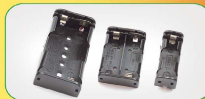
Battery holder contact series