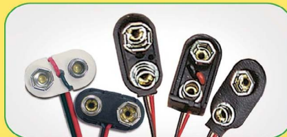
A variety of battery snaps