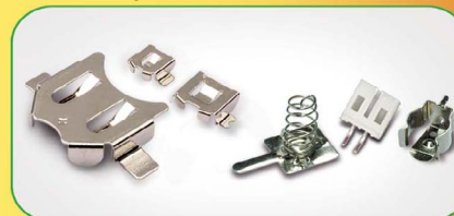
Battery clips and battery contacts