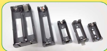
Customizable battery holders