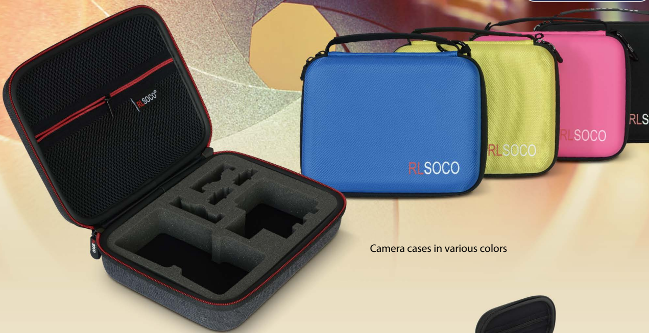
Camera cases in various colors