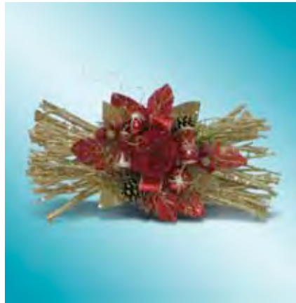
Geuel (profile page 30) Model: O3R18-ZGO MOQ: 24 pieces Packaging: Carton Delivery: 75 days Price: $8.50 Description: Flower swag; paper and wooden base; with plastic balls and ribbon; 18x8x7in