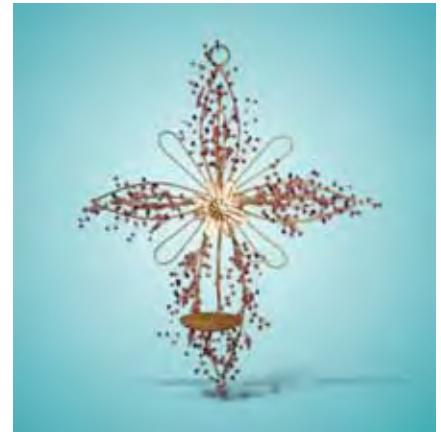
Greenflex (profile page 32) Model: BV-2116 MOQ: 1,000 pieces Packaging: Polybag, inner box, master carton Delivery: 60 days Price: $6.87 Description: Candle holder; wrought iron; with sequins and glass beads; 18in