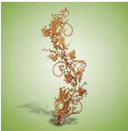
Greenflex (profile page 32) Model: BV-2118 MOQ: 1,000 pieces Packaging: Polybag, inner box, master carton Delivery: 60 days Price: $11.95 Description: Candle holder; wrought iron; with sequins and glass beads; 21in