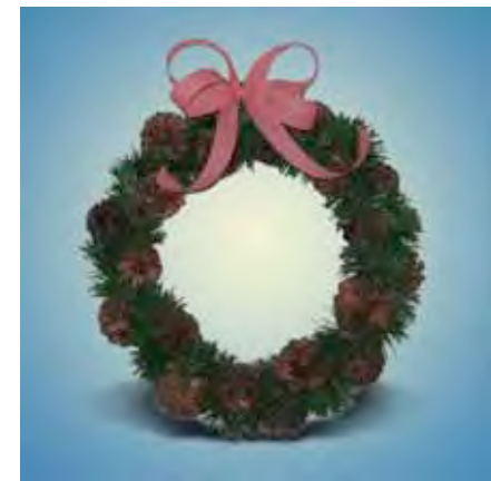
Greenflex (profile page 32) Model: PC-2112 MOQ: 2,000 pieces Packaging: Polybag, inner box, master carton Delivery: 60 days Price: $3.68 Description: Christmas wreath; PVC leaves, natural pine cones and ribbon; 12in