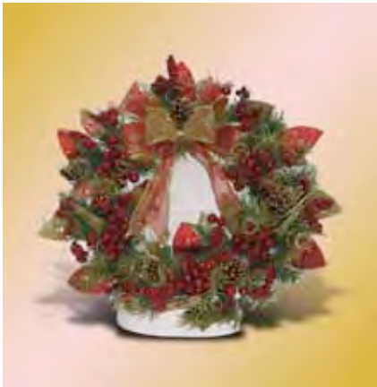
Geuel (profile page 30) Model: NR6-WVW MOQ: 24 pieces Packaging: Carton Delivery: 75 days Price: $14.50 Description: Christmas wreath; ribbon, berries, pine cones and paper; 19x19x4in