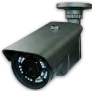
Ansjer (profile page 19) Model: C168136 MOQ: 200 units Description: Color CCD camera; 1/3in Sony CCD, Effio DSP; 2.8 to 12MP; 700 TVL; 90-degree viewing angle; NTSC/PAL; wired OSD control