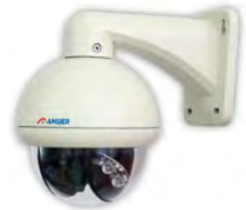
Ansjer (profile page 19) Model: C286146 MOQ: 50 units Description: Mini PTZ camera; 1/3in Sony CCD, Effio DSP; 700 TVL; 5 to 15mm auto-iris lens; 30 to 90-degree viewing angle; NTSC/PAL; EIA-485 control port