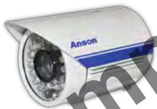
Anson (profile page 20) Model: IT-WG0944IR MOQ: 100 units Description: Water-resistant IR camera; 1/3in Sony 960H CCD; 680 TVL; 8/12mm lens; 0lux/F1.2 minimum illumination with IR on; 50m IR range; NTSC/PAL