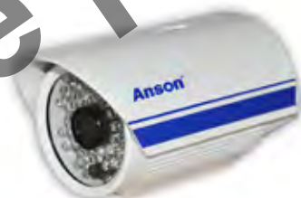
Anson (profile page 20) Model: IT-WG0824IR MOQ: 100 units Description: Water-resistant IR camera; 1/3in Sony 960H CCD; 680 TVL; 3.6/6mm lens; 0lux/F1.2 minimum illumination with IR on; 30m IR range; NTSC/PAL