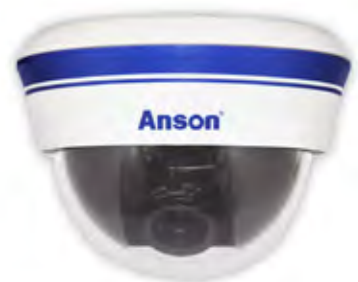
Anson (profile page 20) Model: IT-DG0304GC MOQ: 100 units Description: Analog dome camera; 1/3in Sony 960H CCD; 680 TVL; 4 to 9mm manual focus lens; 0.1lux/F1.2 minimum illumination; >48dB S/N ratio; NTSC/PAL