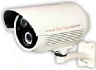
Ansjer (profile page 19) Model: C170136 MOQ: 200 units Description: Color CCD camera; 1/3in Sony CCD, Effio DSP; 2.8 to 12MP; 700 TVL; 90-degree viewing angle; NTSC/PAL; wired OSD control; IR LED array